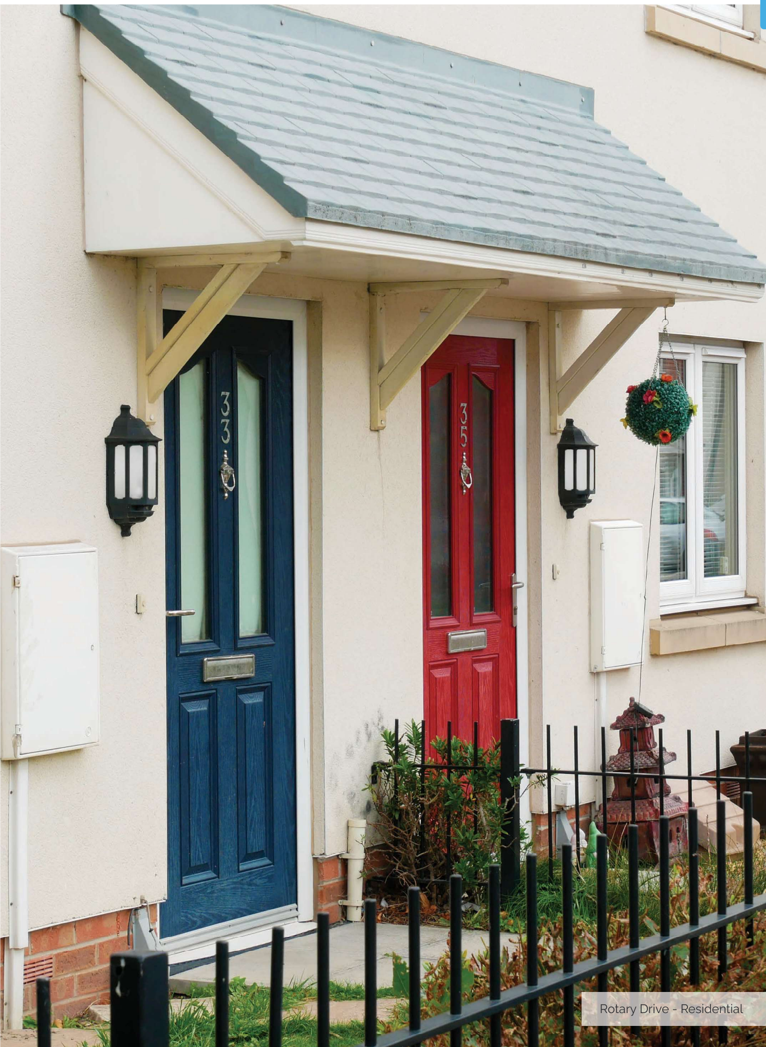
Rotary Drive - Residential