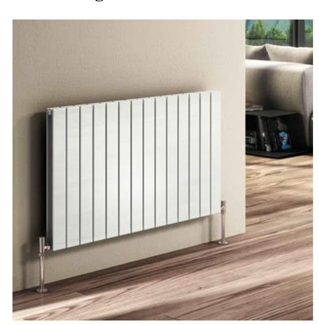
Do not remove any ventilation ducts at the top of the radiator

Do not drape curtains over the radiators, this will affect their performance