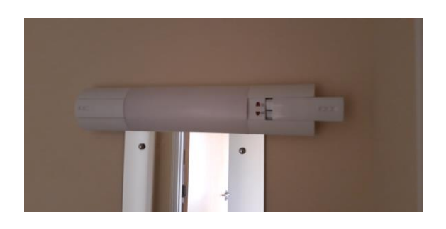
Under Kitchen Task Light 230v 4W Led light To change the light, unplug the mains lead, unclip from its holder and replace with a new one