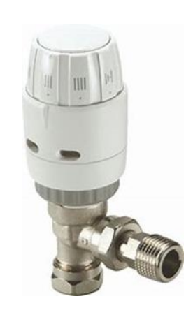
Thermostatic Radiator Valve