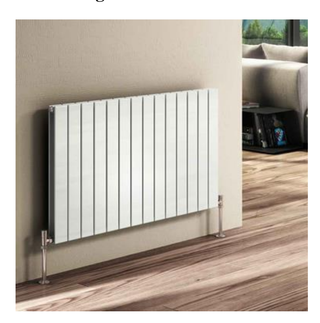
Do not remove any ventilation ducts at the top of the radiator

Do not drape curtains over the radiators, this will affect their performance